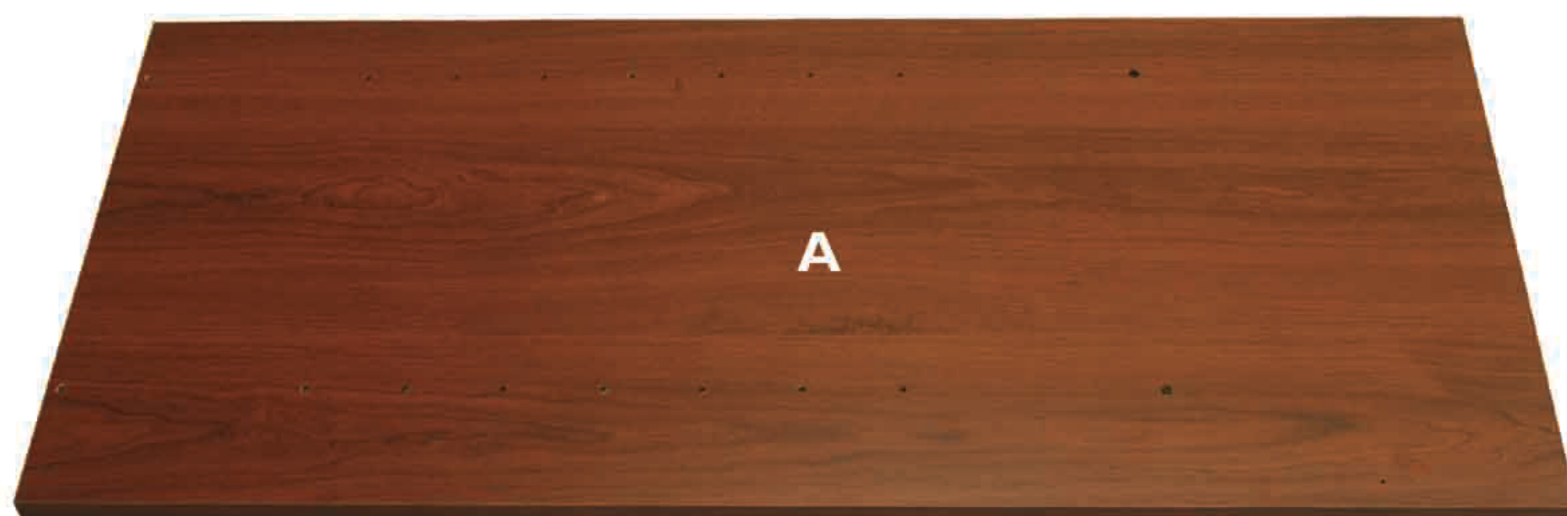
LEFT SIDE PANEL (x1)