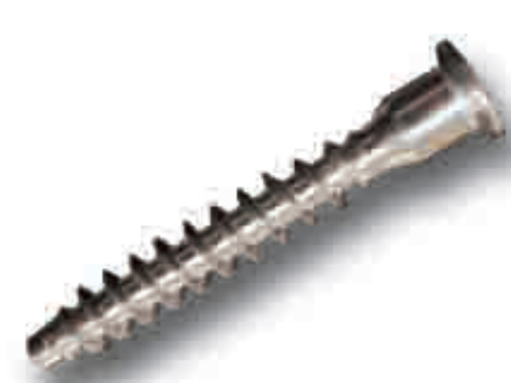
WOOD SCREW (x9)