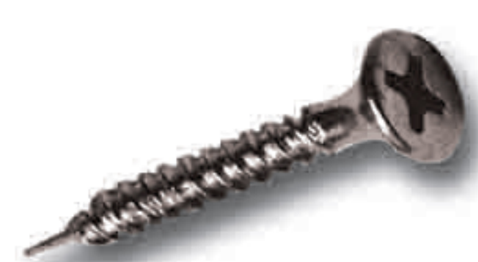
#6x1 1/4 PHILLIP SCREW (x4)