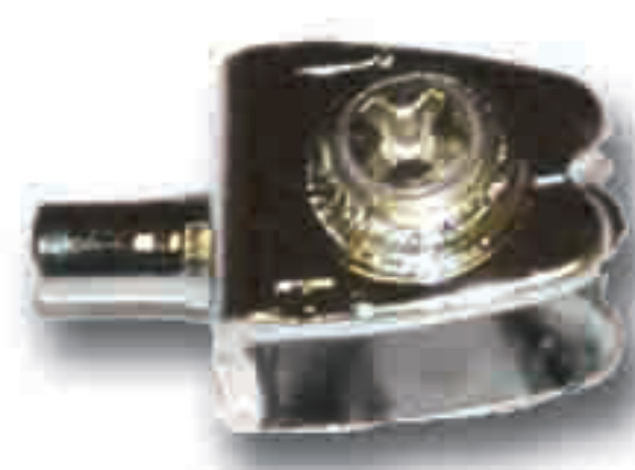
SHELF CLIP (x8)