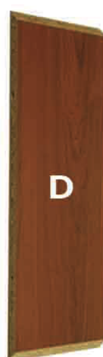
TOE KICK (x1)