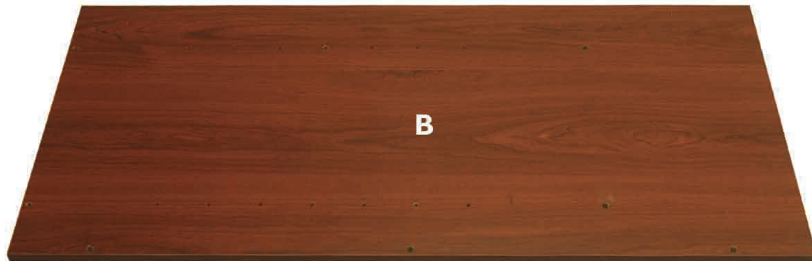
RIGHT SIDE PANEL (x1)