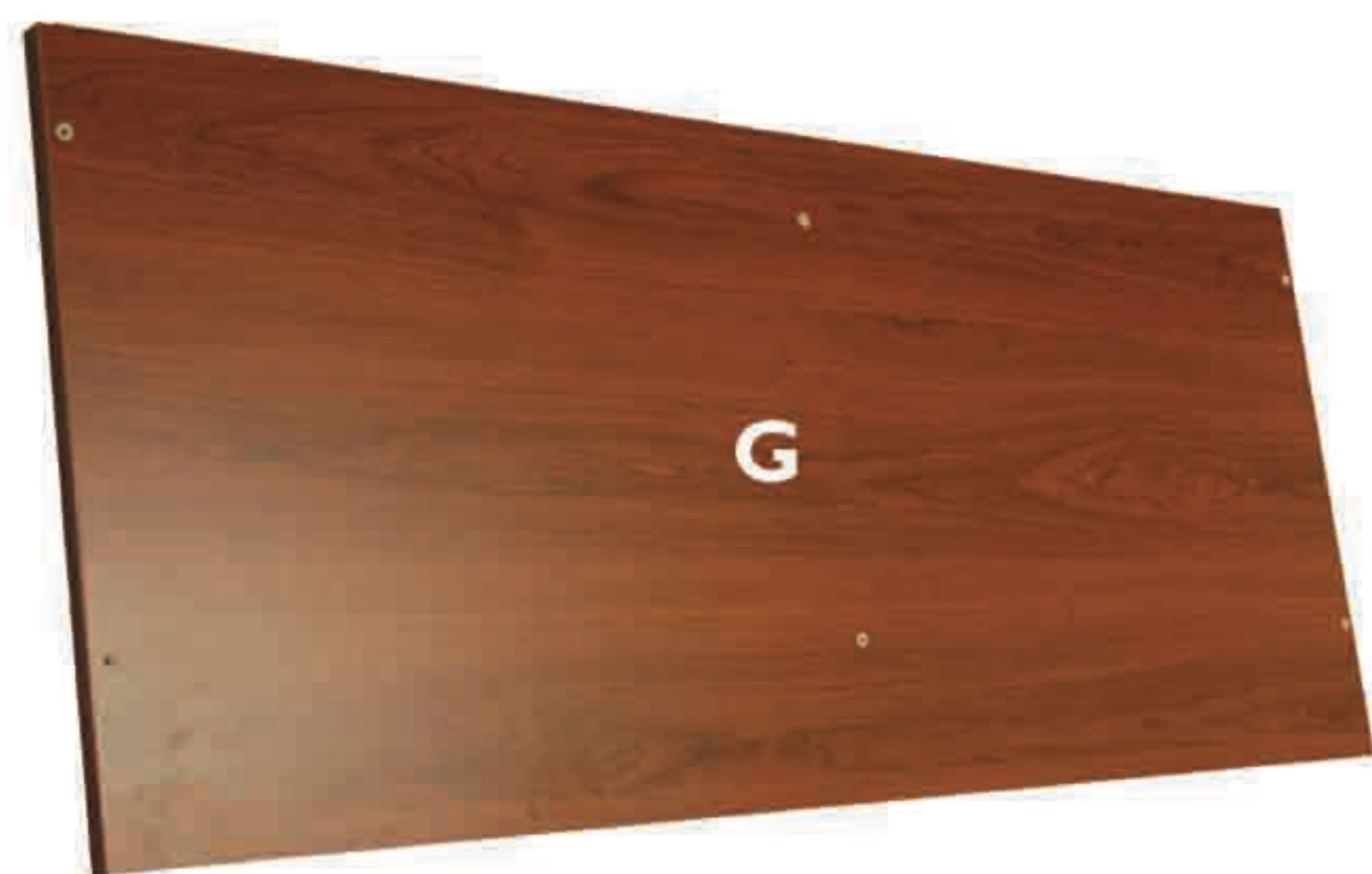
TOP PANE (x1)