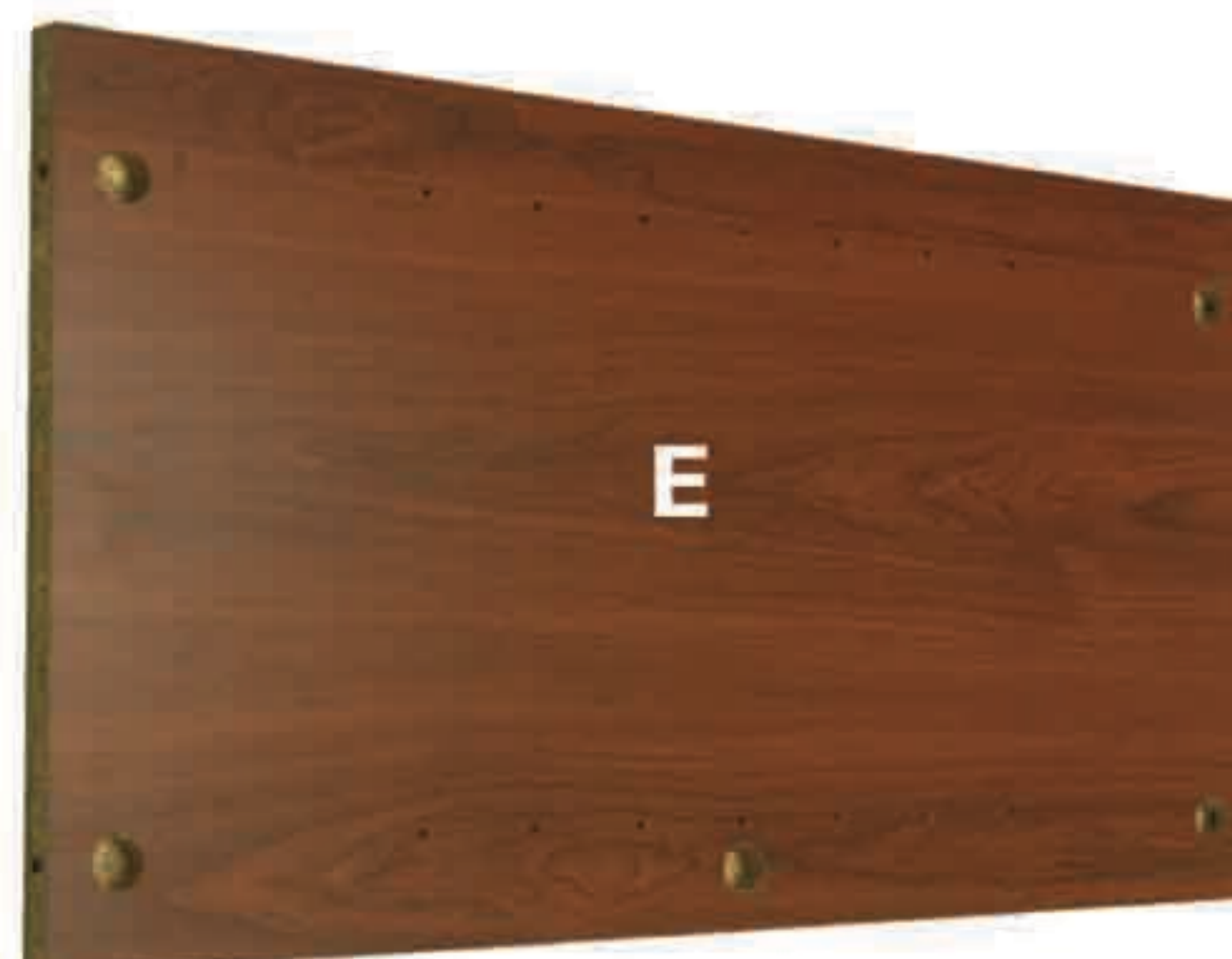
CENTER PANEL (x1)