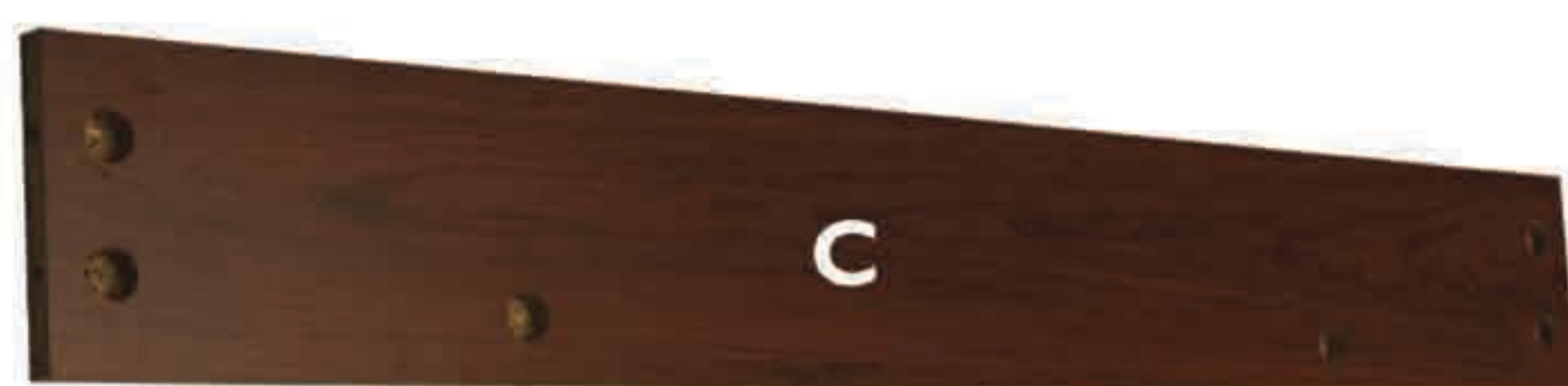
TOE KICK (x2)