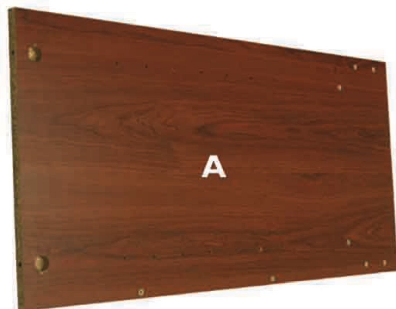
LEFT SIDE PANEL (x1)