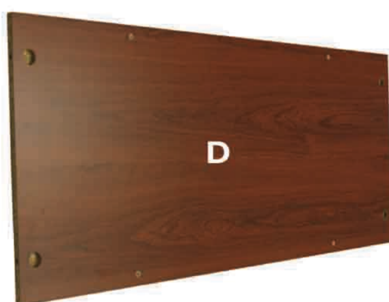
BOTTOM PANEL (x1)