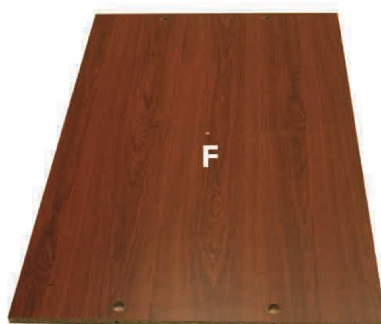
FRONT PANEL (x1)